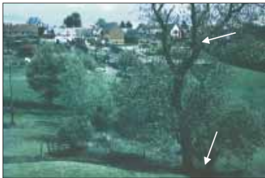
(JUNE 1963) At the foot of the large tree on the right is the spring known as 'Fair Alice'. The position of the spring at Whittle Hole is shown by the top arrow. Both streams run down to the corner of the field known as 'Lord's Garden' to form Whittle Brook. The large white house (Tudor House) seen through the branches of the tree was the home of G. W. Wilson, the author of Chronicles of Whitchurch . Top left can be seen The Old Court House.