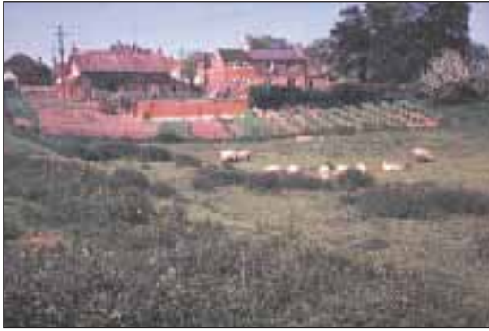
(MAY 1964) This area, on the south side of Weir Lane, and to the east of Bolebec Castle was known as 'The Butts' and was used for archery practice in the middle ages.