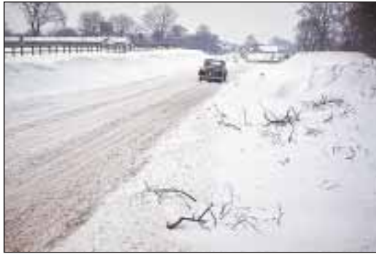
(FEBRUARY 1963) The big freeze. It started to snow on Boxing Day 1962 and the last of the snow did not disappear until almost four months later.